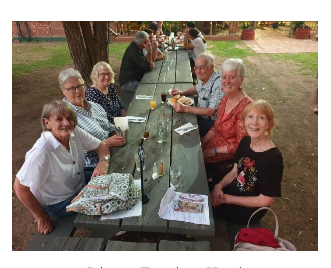
Dinner, Terminus Hotal