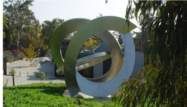
16 acres of heritage listed Sculpture Park and Gardens.

With support from U3A S&D, the Travellers (and any U3A member) have hired a bus to take a group to the amazing and historic Heide Museum of Modern Art at Bulleen. There is something for everyone there – art, history, gardens, sculpture, architecture and of course a restaurant! This is an easy way to get to a not so easy to get to, home of the Heide School of Art – think Tucker, Nolan, Perveval and Joy Hester.