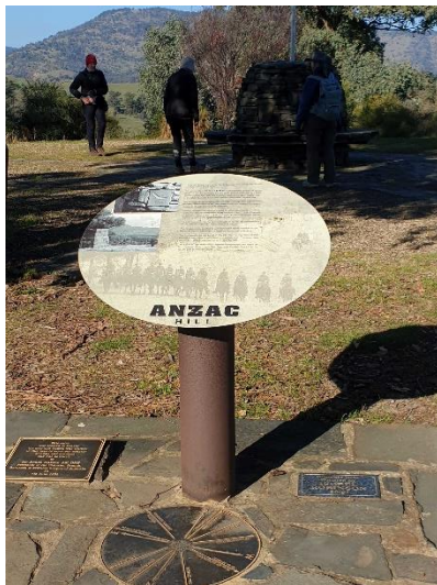
On top of Anzac Hill