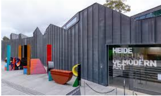
New Heide Gallery linked to HEIDE 2