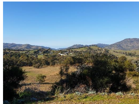
View from Anzac Hill