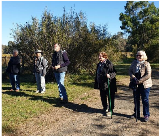
Along the River