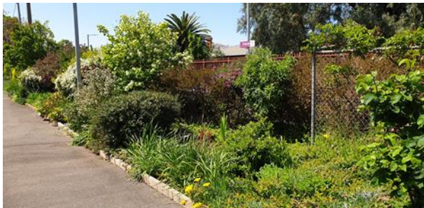
The Garden at the station'