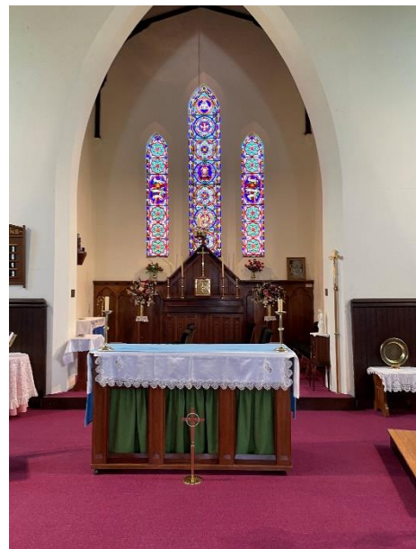
Christ Church Anglican Church