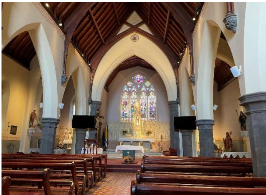
St Patrick's Catholic Church The stained glass windows were magnificent as were the tiles and the Stations of the Cross plaques.