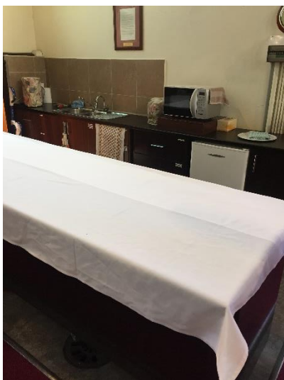
Anglican Church. The hospitality area at the back of the church. Something we all noticed: there appears to