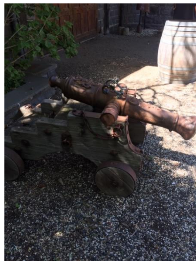
An artefact at the Kilmore Gaol.